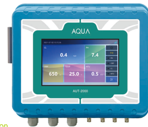
7寸彩色液晶屏显示 7-Inch Color LCD Display