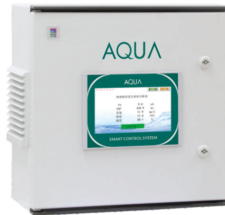
7寸彩色液晶屏显示 7-Inch Color LCD Display